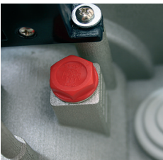
MOTOR & GEARS OIL LUBRICATION