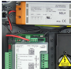
UNIGATE INVERTER EQUIPPED